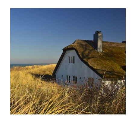
the house of me = my house