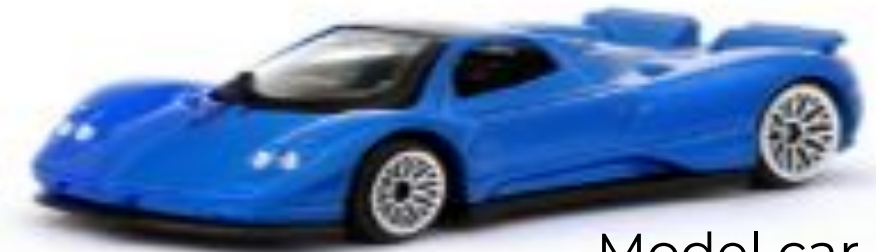
Model car £8 and 20 p,