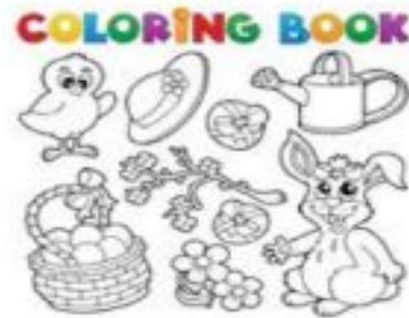
Colouring book £2 and 45 p,