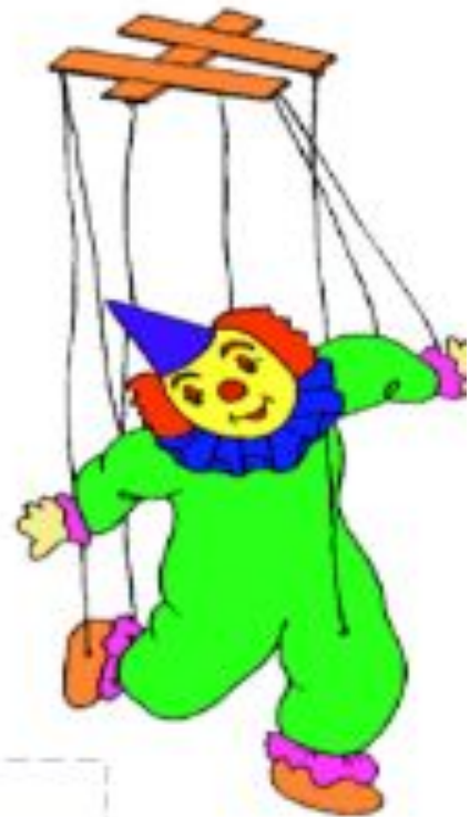
Puppet £6 and 55 p,