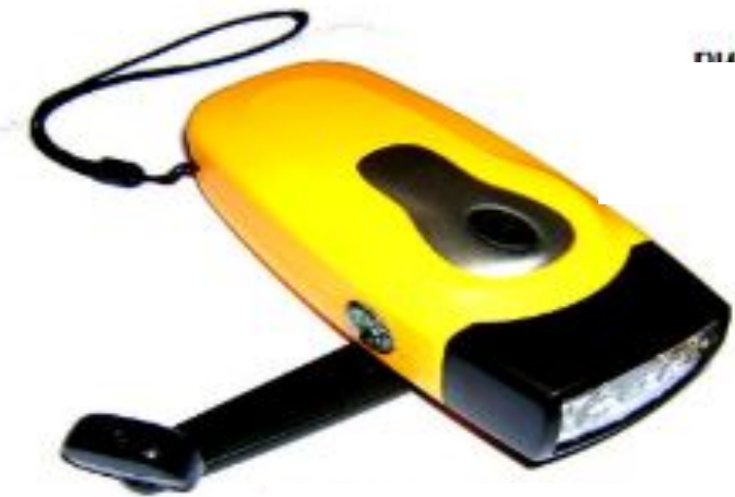
Torch £5 and 38 p,