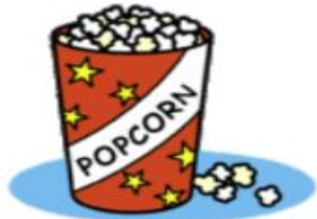
Popcorn £1 and 49 p,