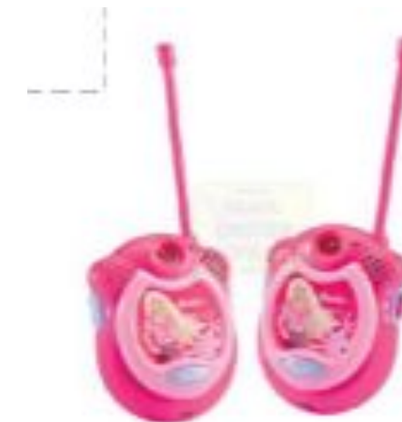
Radio £7 and 59 p,