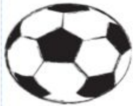
Football £3 and 99 p,